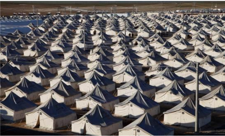
An overview of Viransehir camp, Sanliurfa