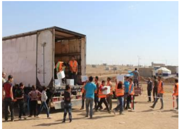
Food distribution for new arrivals from Kobani in Gawilan.