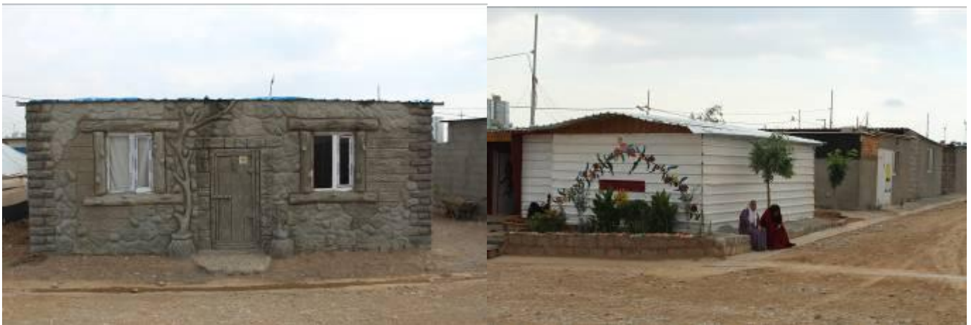
Self improved refugee shelters in Domiz 2.