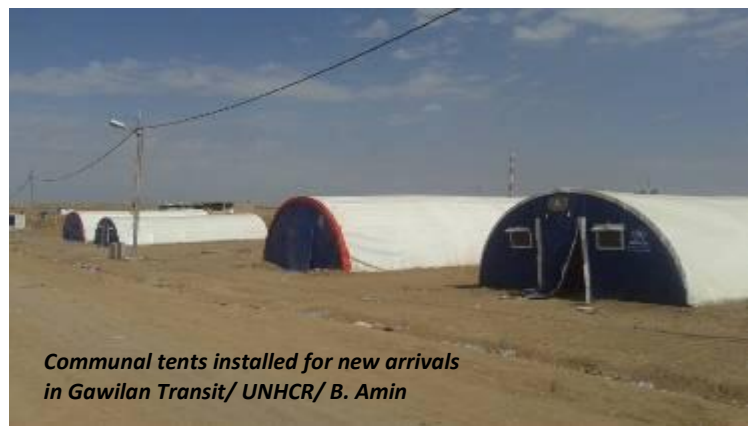
Communal tents installed for new arrivals in Gawilan Transit