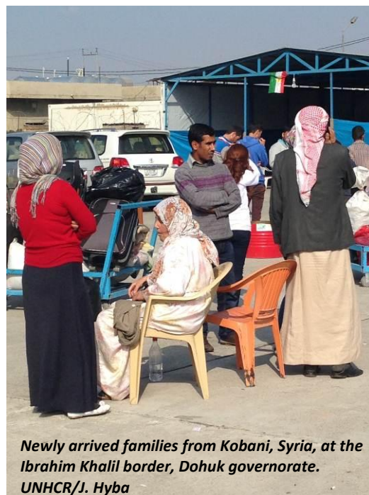
Newly arrived families from Kobani, Syria, at the Ibrahim Khalil border, Dohuk governorate.