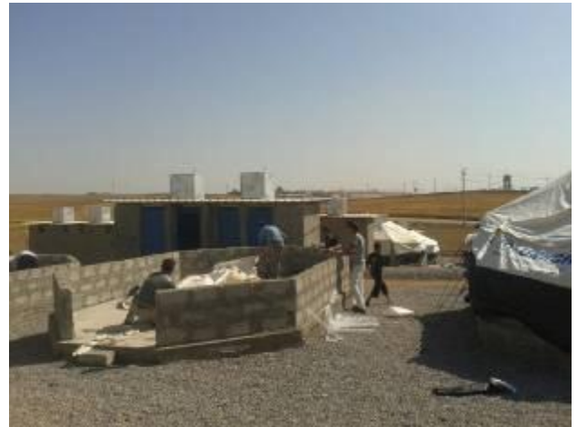
Setting up new tents in Gawilan for Kobani arrivals.