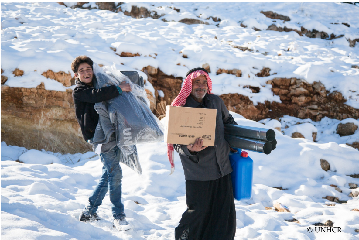
Also this winter blankets, stoves and cash for winter will be distributed to those in need

Distributed a total of around 1,841,700 USD as cash assistance for multiple purposes to 10,766 of the most socio-economically vulnerable families. Distributed newcomer NFI kits to 27,155 persons (5,431 families). A standard kit consists of one blanket and one mattress per person (5 blankets and 5 mattresses per family/kit on average), one kitchen set and one hygiene kit per family, and a baby kit for each child under the age of 2 years.