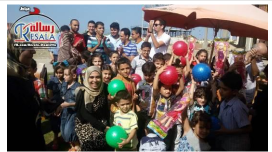
Syrian and Egyptian children during their participation in an activity day organized by Resala in Damietta, Photo/ © Resala