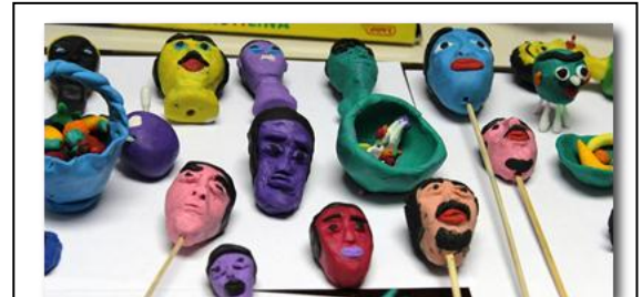
Some of the art work produced by women during the art session