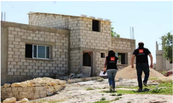
NRC staff inspect housing works for the construction of additional housing units in Jordanian host communities