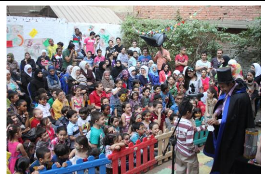
Children at Tadamon Fasial – Haram Community centre annual event