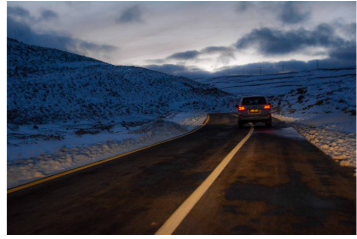
Government public and emergency services have cleared roads across the affected parts of the country

more broadly at higher altitude in the western governorates. Snow accumulation reached up to 60 cm in Jerash and Ajloun, with many areas without electricity and telephone services. By Sunday, conditions in parts of Amman (Sahab), Ajloun, Jerash, Karak, Salt and Tafilah remain hazardous with the higher altitudes translating to lower temperatures, larger snowfalls and less accessibility on the sub-roads and in some instances the main roads. In the south, Karak and Tafilah were initially difficult to access.