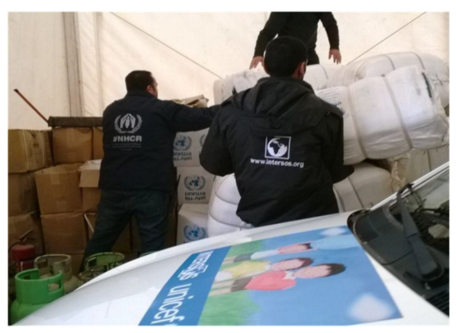
Intersos teams preparing for distribution of non-food items in Mafraq area