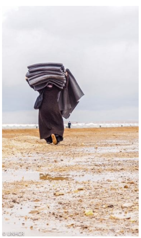
Elderly woman receives UNHCR blankets in Azraq

Bread distributions were slightly delayed due to road closures but were conducted calmly without incidents.