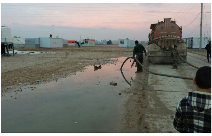
JEN trucks operating out of Zaatari