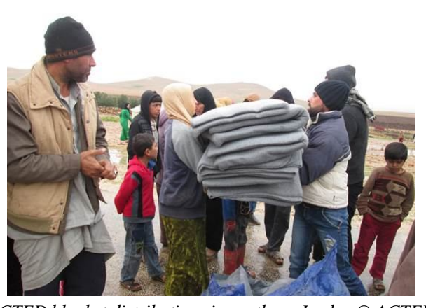
ACTED blanket distributions in northern Jordan