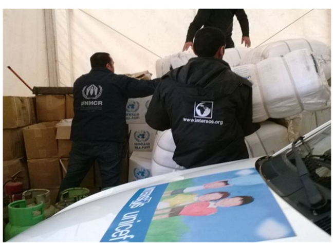
INTERSOS teams preparing for distribution of non-food items in Irbid area