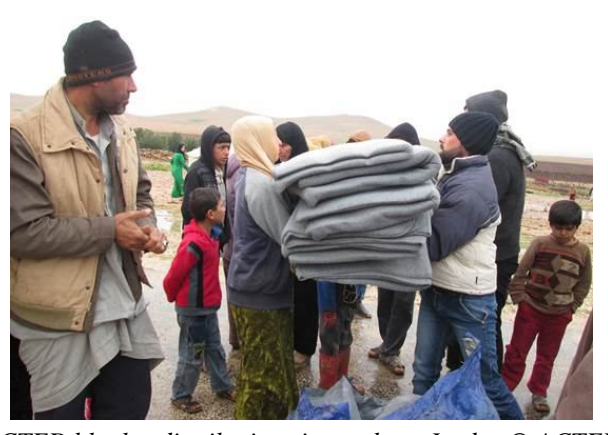
ACTED blanket distributions in northern Jordan