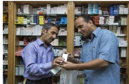
Syrian man buying his medicine