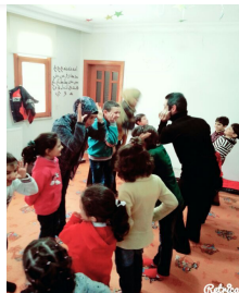
IOM - Recreational activities at IBC Istanbul

In April, UNICEF expanded and strengthened the child protection response in Turkey through the establishment of the "My Happiness Child and Family Centre" in Gaziantep. The centre, which is operated by a national NGO partner, offers structured psychosocial support (PSS) programmes, recreational activities and specialized child protection services to marginalized children, adolescents and youth, with a focus on those out of school and engaged in labour. 5,250 children (2,853 girls, 2,397 boys) benefitted from regular, structured PSS activities in Child Friendly Spaces (CFS) and Adolescent Friendly Spaces in 23 camps and 4 host communities; an additional 343 children (176 girls, 167 boys) were reached with PSS activities provided by 2 mobile units deployed to the southern provinces of Şanlıurfa and Hatay. UNICEF has now trained 562 individuals on child protection, exceeding its 2016 target by over 40%.