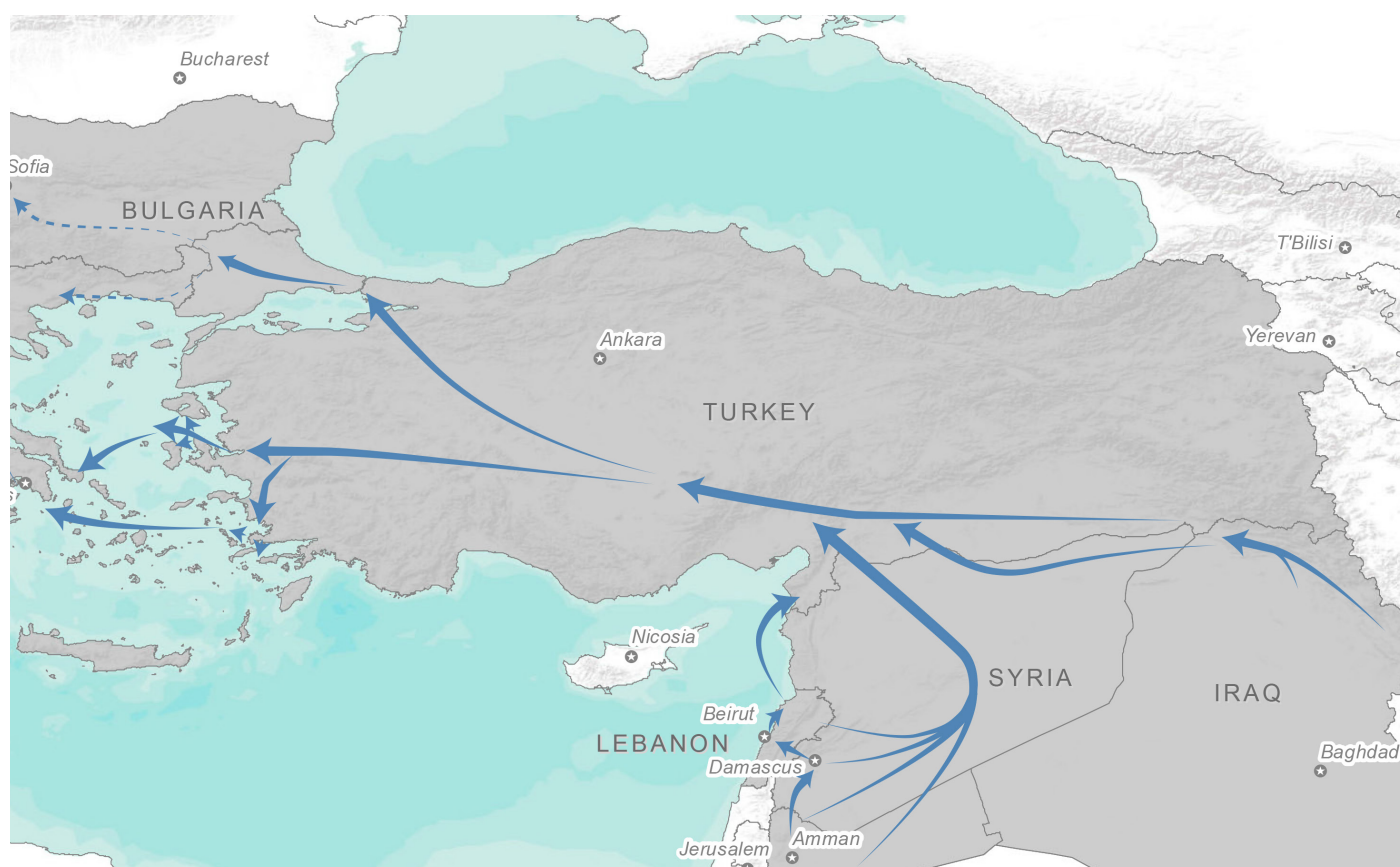
Map 1: Primary reported routes towards Europe from Syria, Iraq, Lebanon and Jordan

For those with passports, the majority had taken the most direct route to get to Turkey, either by plane from Beirut, Amman, or Erbil, or by boat from Tripoli (Lebanon). Due to the official closure of border crossings points between Syria and Turkey and the presence of roadblocks and ongoing conflict, many migrants arriving directly from Syria reported having travelled via Lebanon instead.