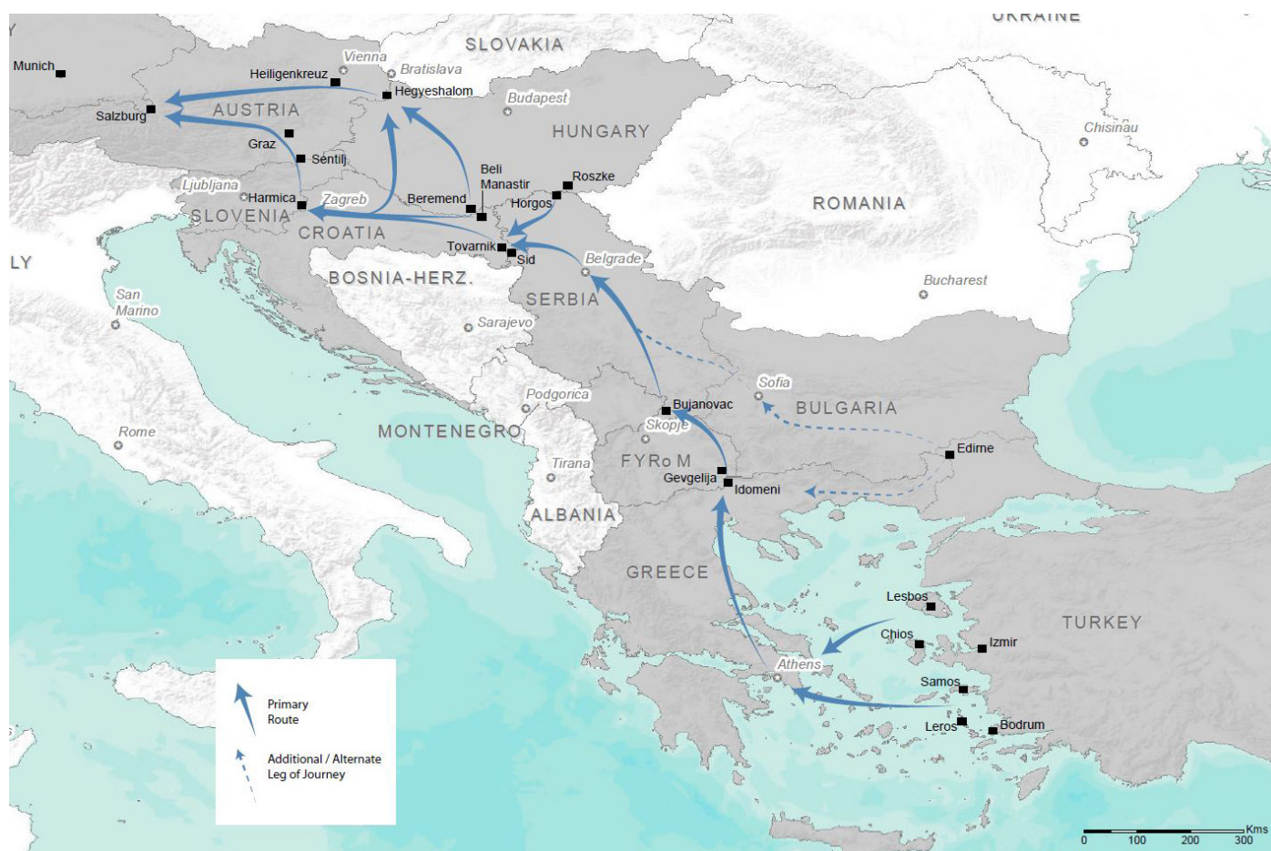
Map 2: Primary reported routes through the Balkan Corridor

In Serbia, the situation became considerably more complicated, with a multitude of different routes observed between Serbia, Slovenia, Hungary and Croatia. The use of different routes was primarily influenced by the opening and closing of borders, the provision of transport by authorities, and rumours among those travelling as to which routes were quickest and easiest. The rapidly changing situation since September 16th caused considerable confusion and rising tensions between different groups, resulting in confrontations with security forces and a small number of cases in which family members became separated from one another.