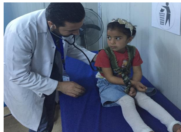
IMC Medical doctor examining a child in Darashakran camp PHC