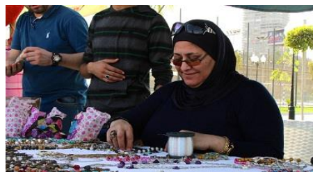
Syrian entrepreneurs showing their products at UN day's open bazar,