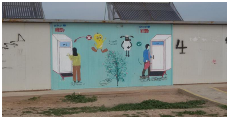
Photos: Qushtapa Camp. Top: completed infrastructure for family latrines. Bottom: Paintings on communal WASH facilities. January 2016.