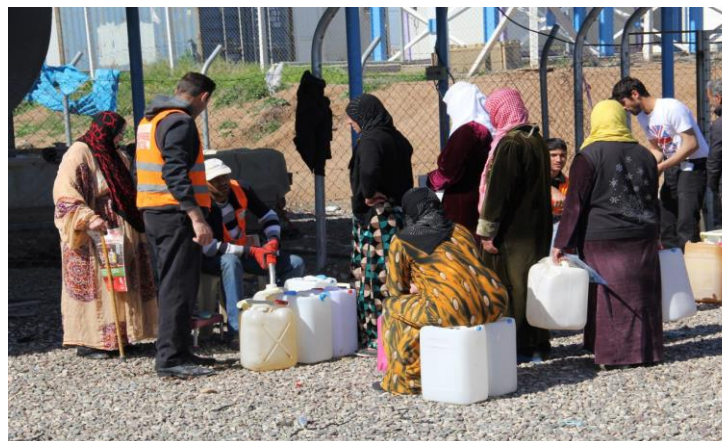
Kerosene distribution in Darashakran camp, 2016