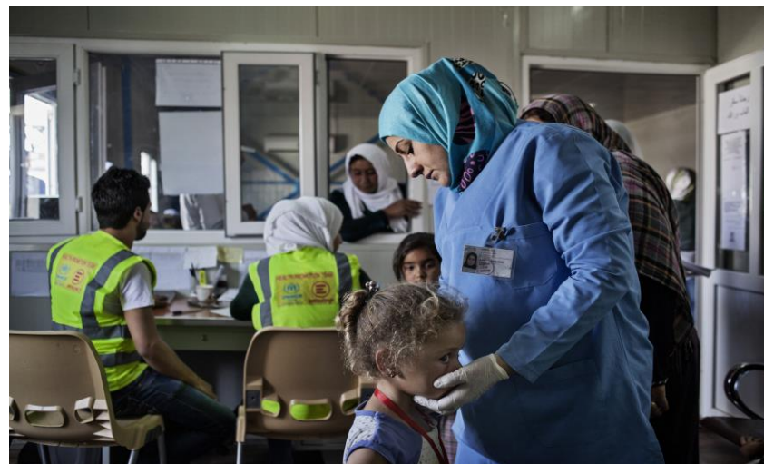
EMERGENCY nurse is checking a patient during triage at Arbat camp PHC, January, 2016