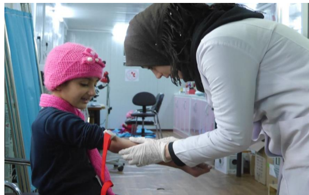
PU-AMI laboratory technician is taking blood sample from a child at Gawilan camp PHC, December 2015.

In Erbil, International Medical Corps (IMC) organization has handed over the PHC/Out Patient Department (OPD) in Kawergosk camp to Department of Health (DoH). DoH-Erbil will run the PHC (OPD services) with financial support from UNHCR. By now, all the PHC is handed over to DoH and it's supported by other UN agencies.