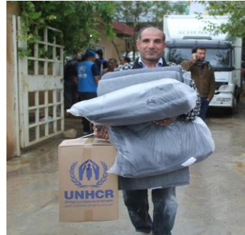
Winter assistance, Erbil, Iraq.

Weather in the Middle East includes low winter temperatures, near or below freezing (especially at higher elevations), and heat during the summer often reaching in excess of 40 degrees Celsius. These extremes require warm clothes, energy for heating, and reinforced shelters during the winter, while in summer refugees need basic materials to create shade and protection from disease vectors, especially for children and the elderly.