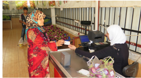
Syrians supported by WFP and TRC's e-food card programme shopping in the camp markets.

-A sub working group to review vulnerability criteria was formed to facilitate cash-based transfers actors' work, and therefore, will be cross sectoral covering initially - FS and NFI actors. The aim is to produce a tool that facilitates a standardised approach to understanding and targeting most vulnerable populations and needs.