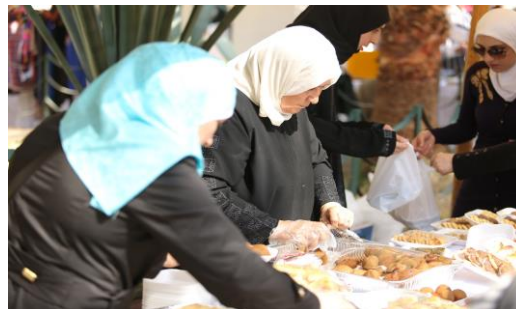
Syrian women displaying their food under livelihood projects, Cairo, Egypt.

See: http://www.sciences-po.usj.edu.lb/pdf/Executive%20Summary.pdf