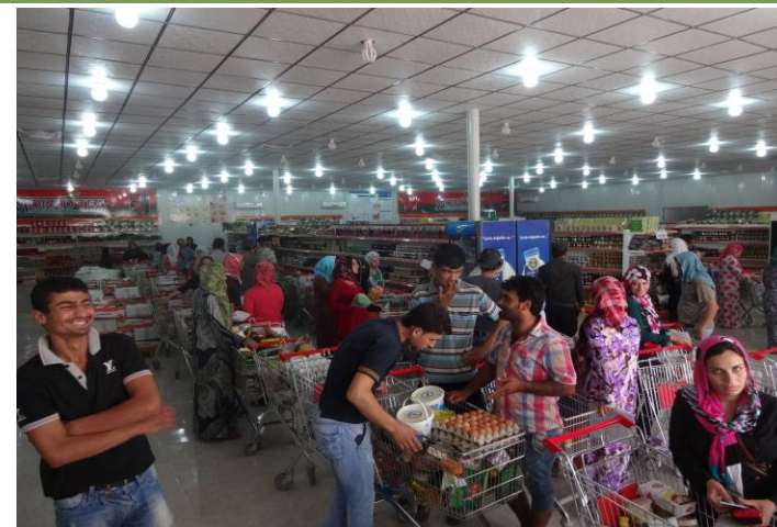
Voucher redemption, Darashakran camp, Erbil.