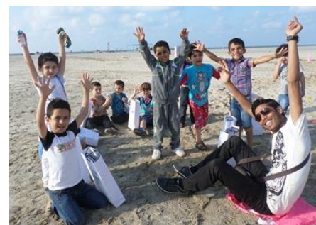
Children on the beach having fun with their gift bags during the event, Photo © TDH.