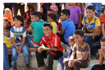
Egyptian and Syrian children attending the puppet show in the Meet and Play area in Masakan Othman