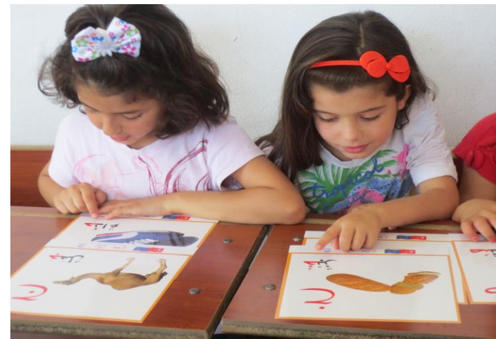
Syrian children using learning materials provided by UNHCR.