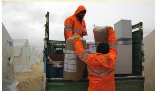
Syrian refugees are provided with core-relief items including cooking facilities, cupboards, blankets, heaters.

IMC has already forwarded the payment to the contracted voucher company, following the signature of the contract and have processed the purchase orders for the issuance of the vouchers. IMC expects to receive the vouchers in the following weeks, and the distribution is expected to start immediately upon receipt of the voucher cards.