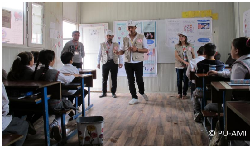
Awareness sessions for 200 Syrian refugee children, school in Waar city, Duhok. PU-AMI.