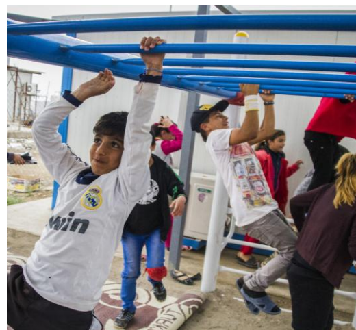
"Syrian children play at Save the Children's CFS in a refugee camp in Erbil, Kurdistan Regional Governorate (KRG), Iraq. The centres give children and young people living in the camp a safe place to play, learn, interact with other children, talk through their experiences and get back to some sense of normality."