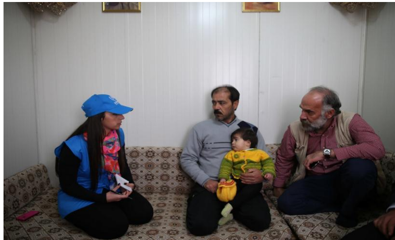
UNHCR staff visiting a Syrian family in Nizip container site.

Significant progress has been also achieved on UNICEF parenting programme. More than 6,000 Syrians benefitted from parenting training programme since the beginning of 2015. Parenting training is an important instrument to build individual, family and community resilience as well as social inclusion mechanism.