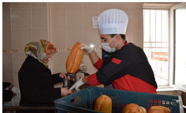
Food kitchen supported by IOM in Gaziantep.

In Mersin, IOM's implementing partners supported provided food baskets to 500 vulnerable individuals living in the province during April 2015.