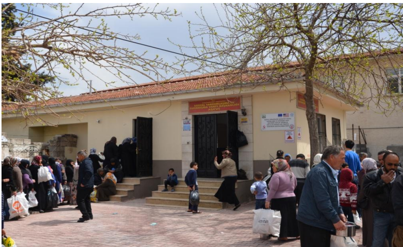
Food kitchen supported by IOM in Gaziantep.

IOM continues with the support for the food kitchen run by the municipality in Gaziantep. The food kitchen supports 737 Syrian households (around 4,000 persons) living in urban areas in Gaziantep with one meal per day for six days per week.