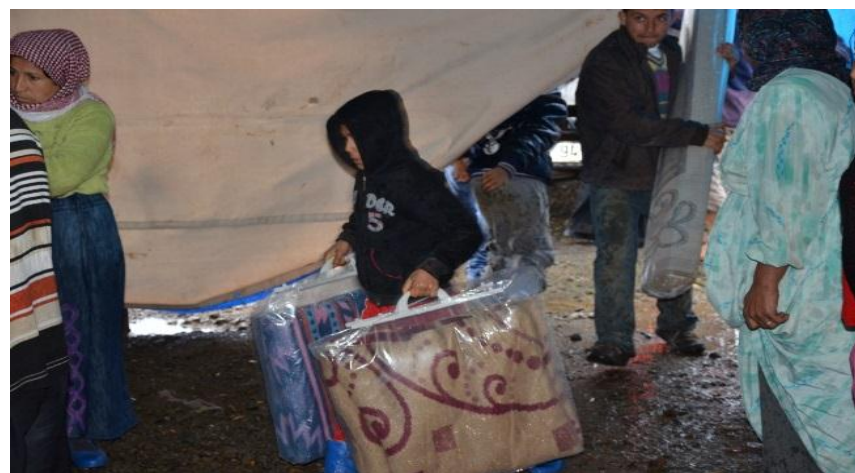
NFI provision by IOM in Hatay

During the month of March, IMC continued with the distribution of vouchers procured with funds from 2014, reaching 1,825 Households (9,705 persons) within the Month. In total, since August 2014, IMC has distributed vouchers in Gaziantep, targetting 8,405 households (44,185 individuals).