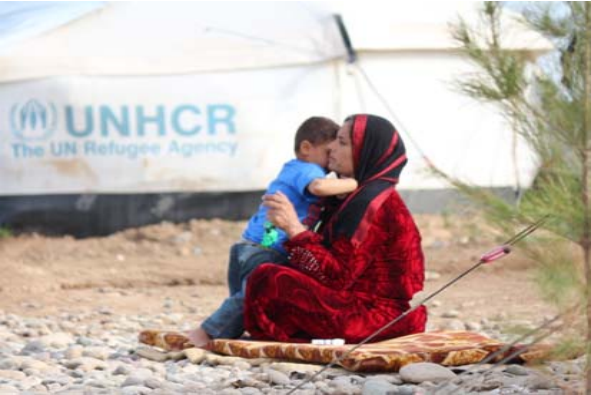
Iraq, KRI