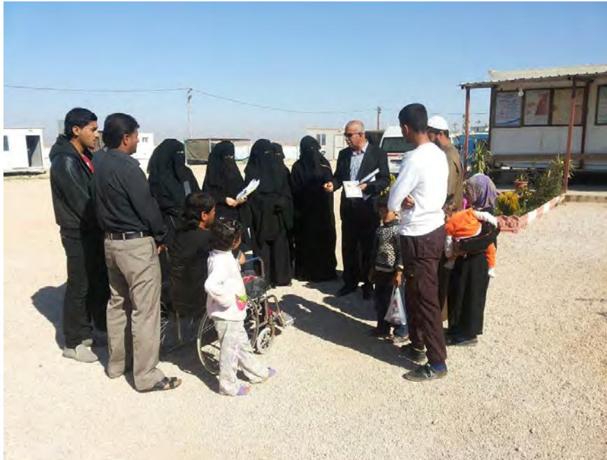
The clinic activities in Al Obaidy Camp