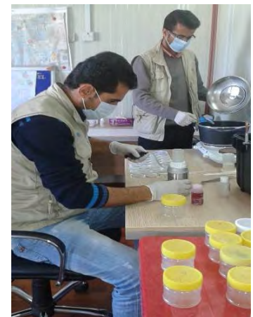
Duhok UNICEF WASH Team ensuring water quality by testing for E. Coli Bacteria