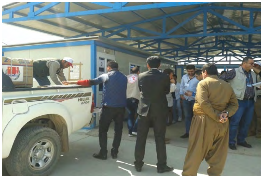
Barzani Charity Foundation bringing medical packages to Gawilan PHC