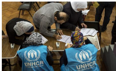
Verification Exercise- Cairo