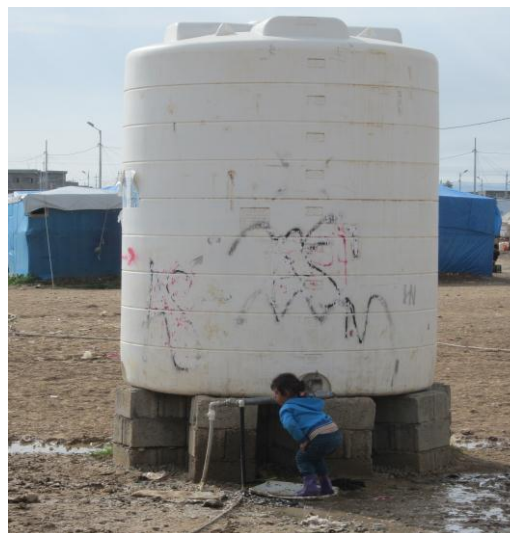
Qushtapa Refugee Camp, Erbil.

Anbar: In Al-Obaidi camp, even with the challenges to access Al Obaidi camp 890 refugees in are provided with safe drinking water by network from Al-Phosphate project through UNICEF'S partner, AFKAR Society.