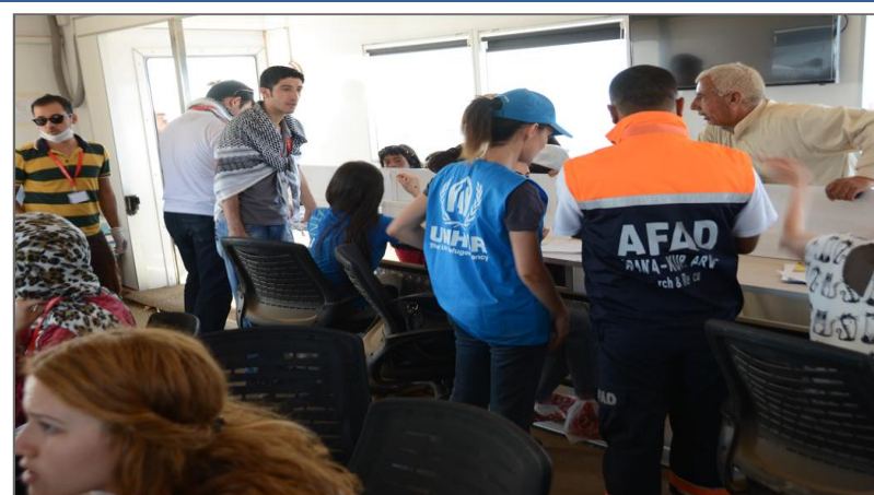
UNHCR and Republic of Turkey Prime Ministry Disaster and Emergency Management Presidency (AFAD) staff are in a mobile registration/coordination center in Suruç, Şanlıurfa.

During the month of February, 36 Syrian Trainers received ToTs from master trainers of the Parenting Training Programme and started to conduct Parenting Training Programme sessions in Adana Sarıcam, Kilis Elbeyli, Nizip 1 and 2 camps. The parenting programme is a collaboration with MOSFP, AFAD and UNICEF which aims to target 12 camps until June 2015. The Parenting programme is innovative as it works directly with the Syrian community in both camps and host communities to raise awareness of child protection issues and to prevent and respond to violations through a community-based approach.