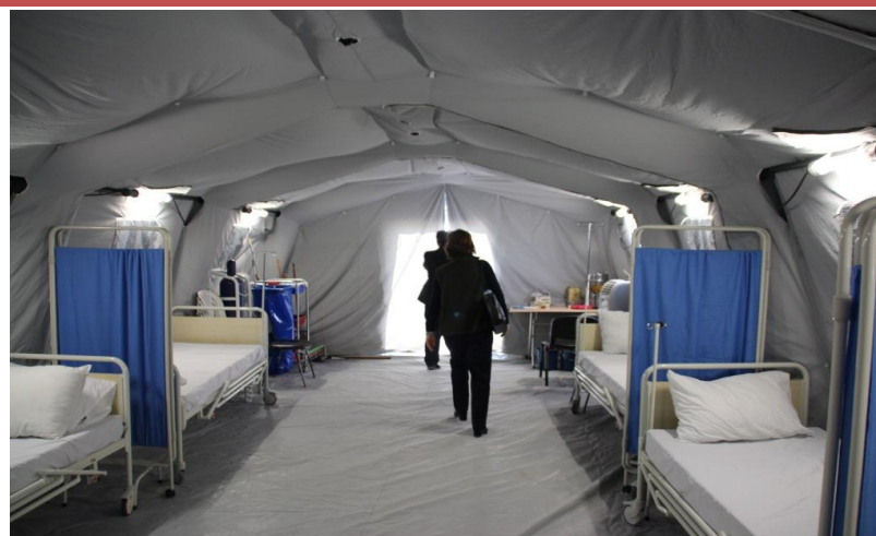
WHO team visited the field clinic in line with the health needs assesment in Suruc Camp

Since July 2013, IOM has been providing transportation assistance in Adiyaman camp for Syrians to reach hospitals. For the month of January 2015, IOM provided transportation to 1,371 Syrians refugees in Adiyaman camp to access health services. During the month of February 2015, 1,396 Syrians commuted between Adiyaman camp and health facilities.