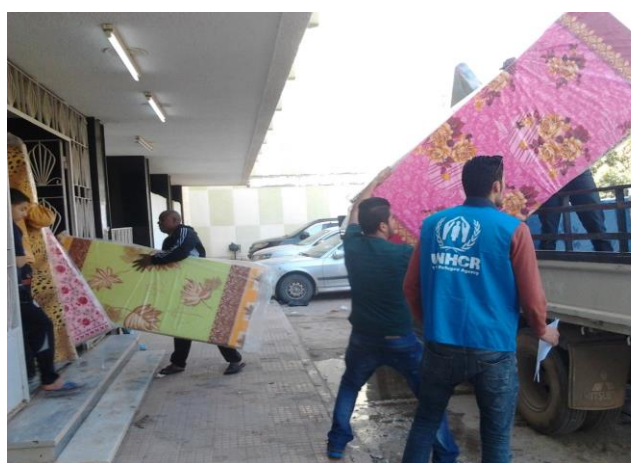
Distribution of essential household items takes place in Benghazi for displaced families sheltered in school buildings, March 2015/UNHCR.