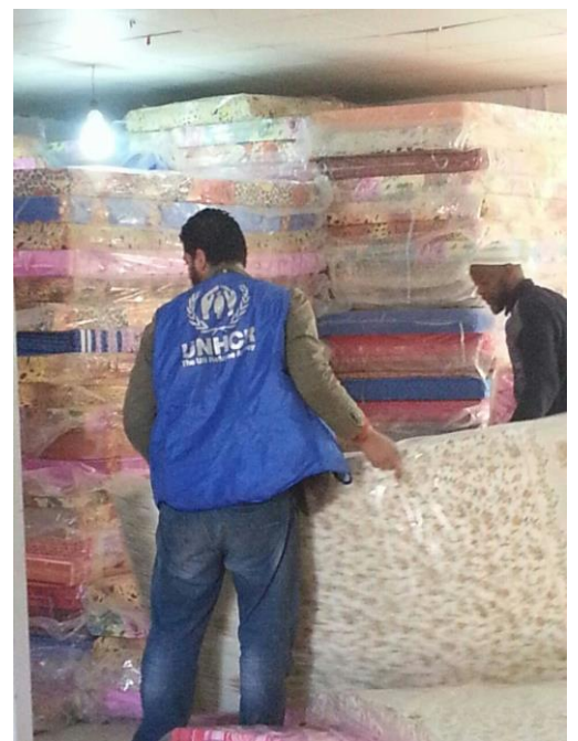
Distribution of essential household items in Misrata. May 2015