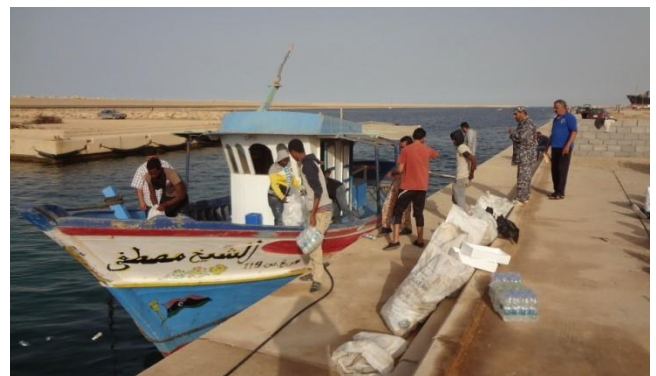
After interception/rescue at sea, persons of various nationalities disembark at the port of Misrata, May 2015.

As a result of the overall instability, Libya continues to be the main transit and departure point for irregular sea migration to Europe. In 2014, over 170,100 persons arrived in Italy and of whom some 141,484 departed from Libya. In 2015, thus far 54,000 arrivals to Italy have been reported. Also of concern to UNHCR are the 4,612 detainees including 229 women and 12 children in government-run detention centres in Libya. To date the Libyan Coast Guard has rescued or intercepted nearly 4,000 individuals from the sea. Those rescued are then disembarked and transferred to a detention centre.