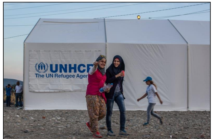
Syrian women inside the reception centre