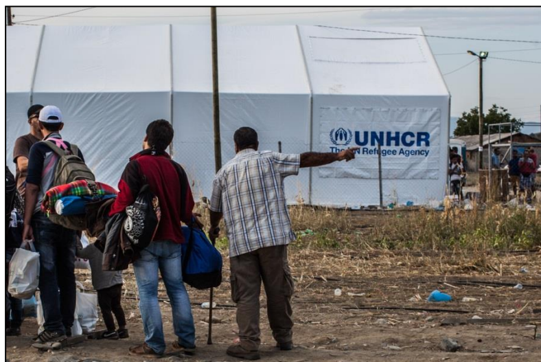
Refugees about to enter Vinojug.

Intention to apply for asylum: 65,658 applications have been filed from 19 June to 08 September 2015 (source: Ministry of Interior).