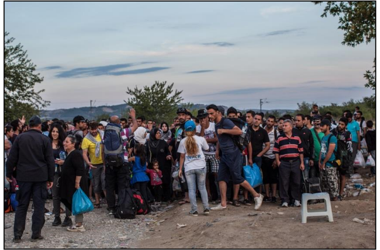
UNHCR staff share information with Syrian refugees.