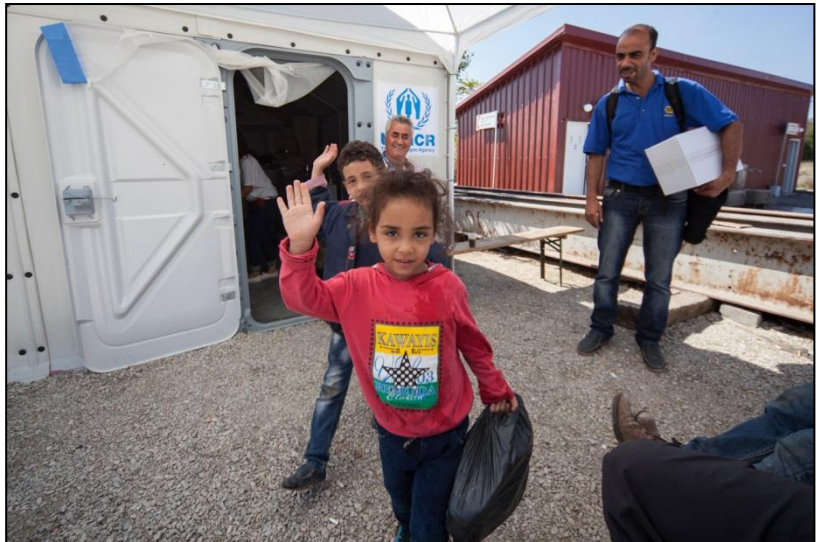
Tabanovce near the Serbian border, Red Cross and UNHCR distributing food.