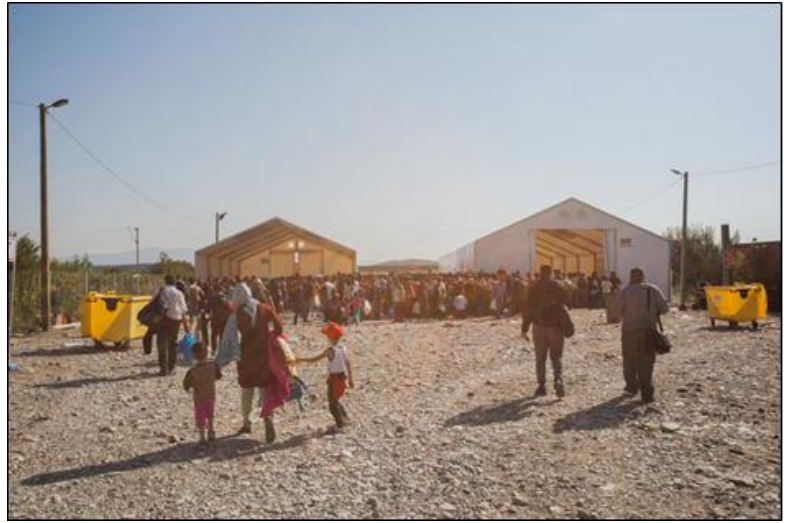
Vinojug site near Gevgelija, Refugees waiting to board the train, UNHCR rub halls.

The Ministry of Interior's officially registered number of refugees and migrants crossing the border from Greece continues to be high with 77,674 persons registered their intention to apply for asylum, including 15,106 children, of whom 2,299 are unaccompanied since 19 June until 15 September 2015. Of these 62,898 (81%) of the arrivals are Syrians, 5,099 (7%) Afghans, 3,694 (5%) Iraqis, 2,086 (3%) Pakistanis and the remainder represent other nationalities such as Somalis, Palestinians, Congolese and Cameroonian. 49 applications for asylum were registered out of which 36 were submitted by Syrians in the same period while from January to end of July 1,675 asylum applications were submitted.