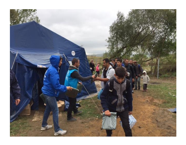
UNHCR staff distributing raincoats to refugees arriving from fYR Macedonia at Miratovac RAP