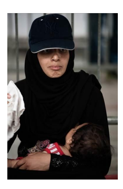
Syrian family awaiting registration outside the One Stop Centre in Preševo, South Serbia

Government of Serbia began preparing 3 new refugee aid points near Kikinda (border with Romania) and Sombor and Šid (border with Croatia), in view of the changed refugee route due to Serbia/Hungary border closure.