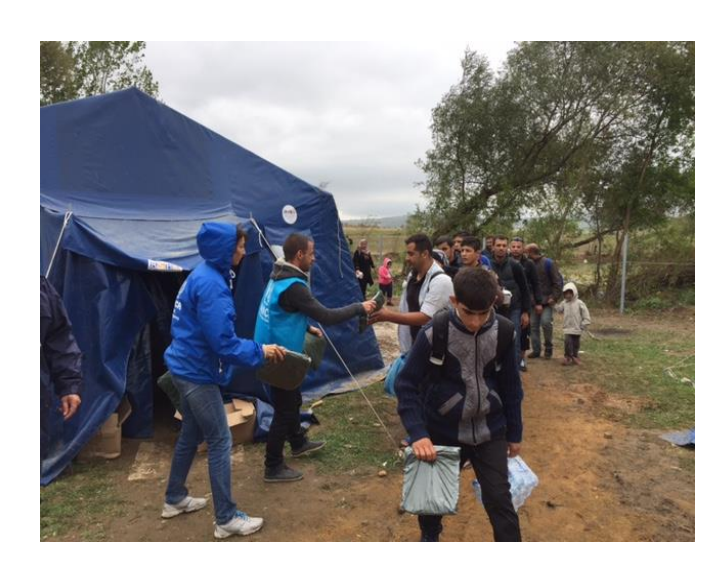
UNHCR staff distributing raincoats to refugees arriving from fYR Macedonia at Miratovac RAP