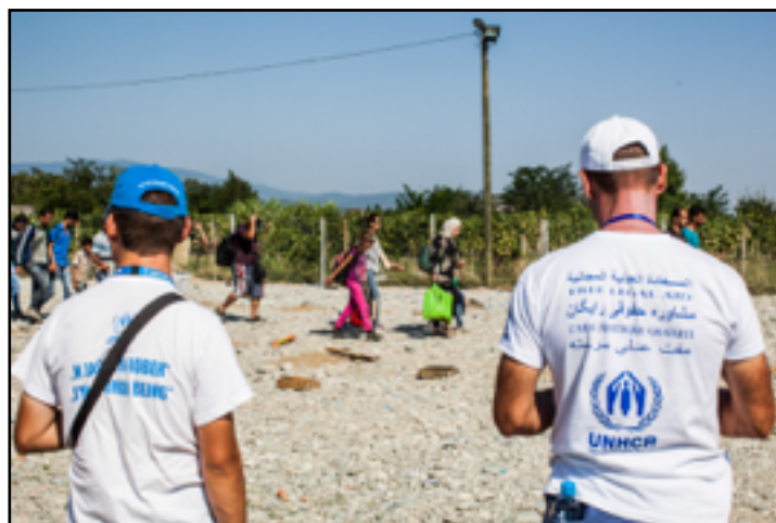
Departure monitoring at Vinojug.

The Ministry of Interior's officially registered number of refugees and migrants crossing the border from Greece, continues to be high with 90,774 persons registered their intention to apply for asylum, including 18,000 children, of whom 2,844 are unaccompanied since 19 June until 22 September 2015. Of these 71,342 (78%) of the arrivals are Syrians, 7,624 (8%) Afghans, 4,904 (5%) Iraqis, 2,569 (3%) Pakistanis and the remainder represent other nationalities such as Somalis, Palestinians, Congolese and Cameroonian. 49 applications for asylum were registered out of which 36 were submitted by Syrians in the same period while from January to end of July 1,690 asylum applications were submitted.