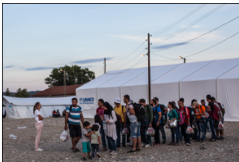
Refugees waiting to leave with the bus.