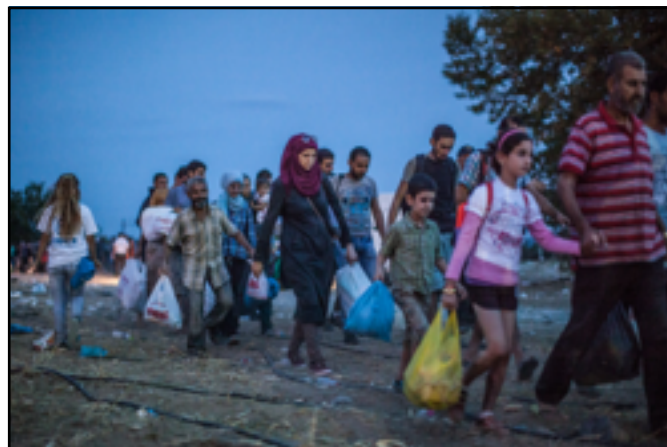
Refugees arriving to Vinojug reception centre.