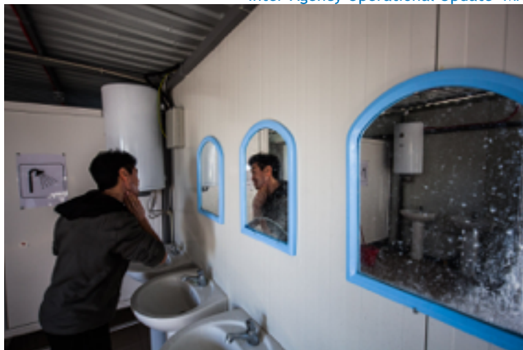
Time for a shave at the shower and toilet block at Vinojug.