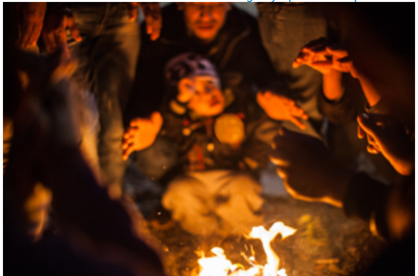
A bonfire keeps refugees warm at Vinojug.