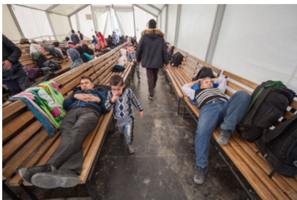
Inside the UNHCR rub hall at Vinojug site two men rest ahead of their onwards journey.

Intention to apply for asylum: 207,905 applications have been filed from 19 June to 03 November 2015 (source: Ministry of Interior).