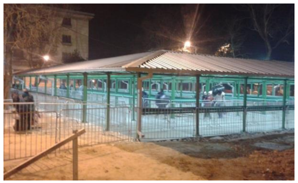
The covered pre-registration waiting area at Preševo RC, Preševo (Serbia), ©UNHCR, 27 December 2015

UNHCR/DRC distributed UNHCR blankets, water, winter jackets, winter boots and socks. The health clinic provided medical assistance at the RAP. UNICEF/DRC/CSW hosted children and mothers in their Child Friendly Space container.