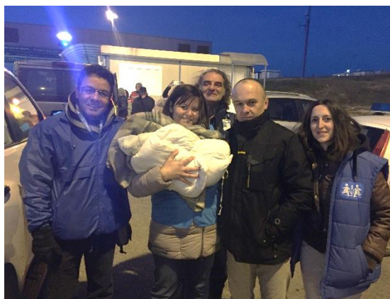
Preševo – An Iraqi family with prematurely born baby was transported over the official border crossing between Serbia and FYRoM in the presence of Serbian authorities and UNHCR teams from Serbia and FYR Macedonia on 14 December, Photo@UNHCR