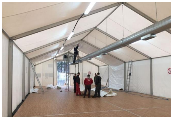
Preševo - Final works on winterization of UNHCR rub halls were ongoing

works were finished 60% by DRC/UNHCR and steel roof is being installed; roofed pathway phase-1 foundation work was finished.