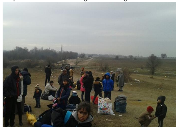
Refugees on their way from the FYR Macedonia border to Miratovac village in Serbia, Photo@UNHCR