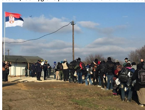
Miratovac – Refugees and migrants arriving to the new RAP