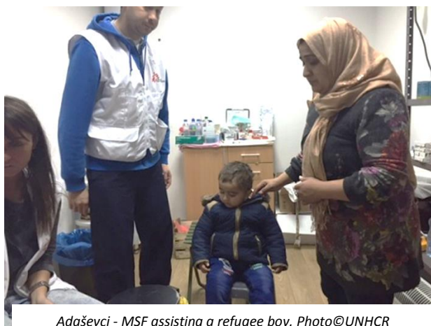
Adaševci - MSF assisting a refugee boy, Photo@UNHCR

■ On 14 December, MoH and UNFPA delivered a mobile clinic to Health Centre Vranje, with accompanying medical equipment including gynecological examination table, ultrasound, electrocardiograph and blood pressure apparatus. UNFPA donation should contribute to the enhanced sexual and reproductive health (SRH) services delivered to refugee women including antenatal, postnatal care and SRH counselling.