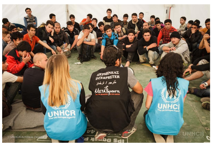
UNHCR staff during an information and orientation talk with a group of newly arrived refugees from Afghanistan at the Mythimna / Molyvos assembly point © UNHCR/A. Zavallis, 13 November 2015