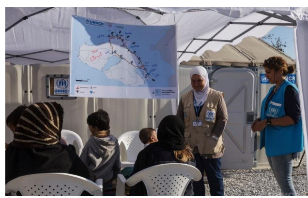
Refugees and migrants waiting to register with Greek authorities at the Moria Reception/Registration Centre before boarding a ferry that will transport them to Athens © UNHCR/A. Zavallis, 17 November 2015