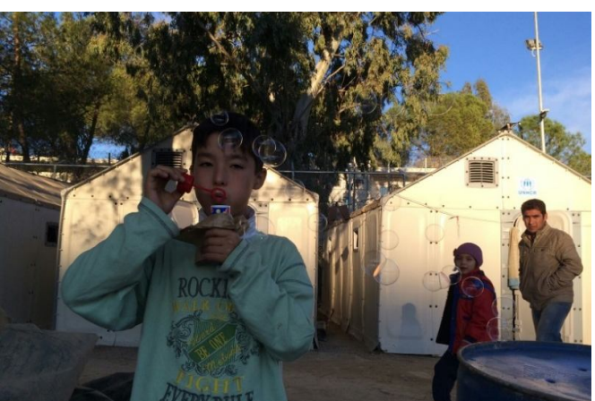
Afghan boy plays with soap bubbles at Moria reception site © UNHCR/B. Cheshirkov, 30 November 2015