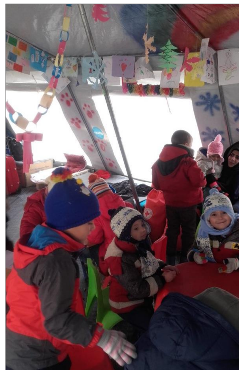
On 16 December, children enjoy morning activities in the UNICEF child-friendly space in Gevgelija, the former Yugoslav Republic of Macedonia.

Social workers, psychologists and pedagogues continue to work restlessly to ensure continuity of child-friendly services in 5 locations (Gevgelija and Tabanovce, the former Yugoslav Republic of Macedonia, Presevo and Adasevci, Serbia and Slavonski Brod, Croatia), where child-friendly spaces are open 24 hours/7 days. Since October 2015, the centres offered services to nearly 60,000 children, including emotional and psychosocial support, family reunification and basic early childhood development activities. In the former Yugoslav Republic of Macedonia, between 30 November and 13 December, 9,418 children, including 96 children with disabilities and 455 unaccompanied children, were able to rest and play in a safe environment in Gevgelija and Tabanovce. Five children who had become separated from family members were supported to be reunited with them. In Serbia, between 30 November and 13 December, 2,498 children and 1,291 mothers benefitted from CFS services in Presevo and Adasevci. In Croatia, three CFS in different sectors of the reception centre in Slavonski Brod are ready for use. Due to the high speed of the movement through the centre, mobile teams are no longer able to provide psychosocial support to refugee children being fast tracked.