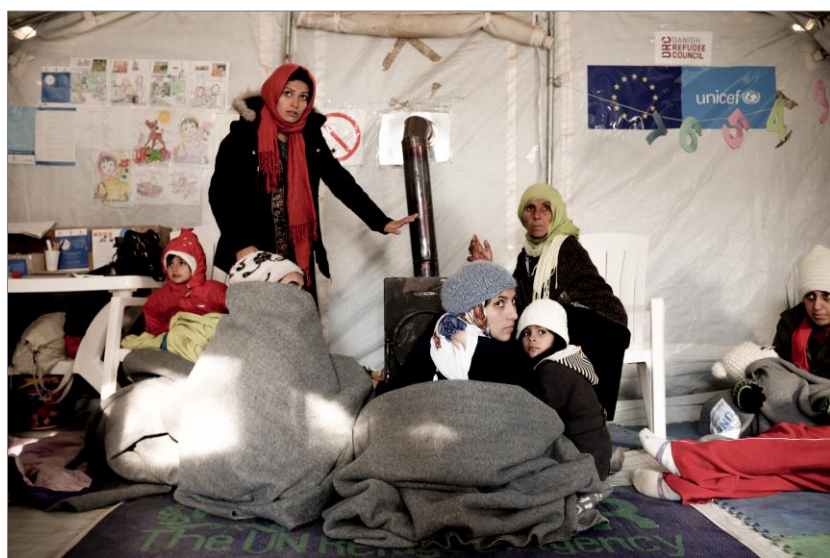
Many refugee and migrant children and their families are facing harsh weather conditions. Thanks to the generous support from the European Union's Humanitarian Aid and Civil Protection Department (ECHO), they can keep warm in the UNICEF-supported child-friendly space in Presevo and receive warm winter clothes which will help them to weather the upcoming winter in Europe.

UNICEF continues to support WASH infrastructure, supply distribution (mainly hygiene kits) and hygiene promotion in response to the most urgent needs of refugee and migrant children. In the former Yugoslav Republic of Macedonia, during the first half of December, 2,759 babies and children were bathed at the mother-and-baby corner in Gevgelija, and were provided with 3,291 diapers, 73 bars of soap, 108 sachets of baby cream and 133 bottles of baby shampoo. In