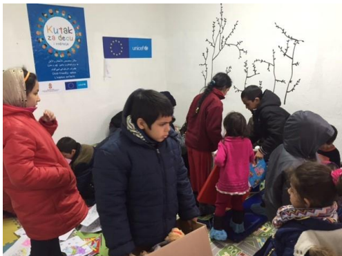
New UNICEF/World Vision child friendly space in Šid RAP (Serbia), 17 January 2016

WAHA and IDC/Sid Health Centre treated asylum seekers at the train station.