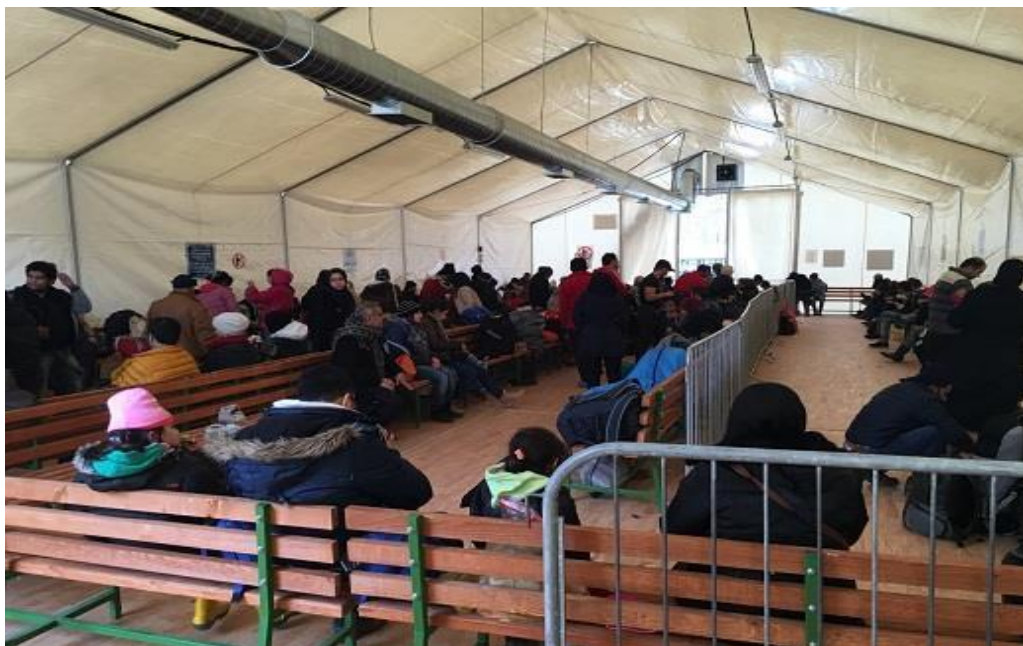
Asylum seekers waiting for registration inside the fully winterized rub hall, Preševo (Serbia) ©UNHCR January 2016.

In Italy , no transfers took place under the EU relocation scheme. On 11 January, 35 persons, from Somalia, were detected in the Province of Lecce, in Apulia. The dead body of a Somali woman was also retrieved on the shore, whilst around 8 persons are still reported missing at sea. The group recounted to have left from Greece and to have been beaten by the smugglers and kicked out of the dinghy.