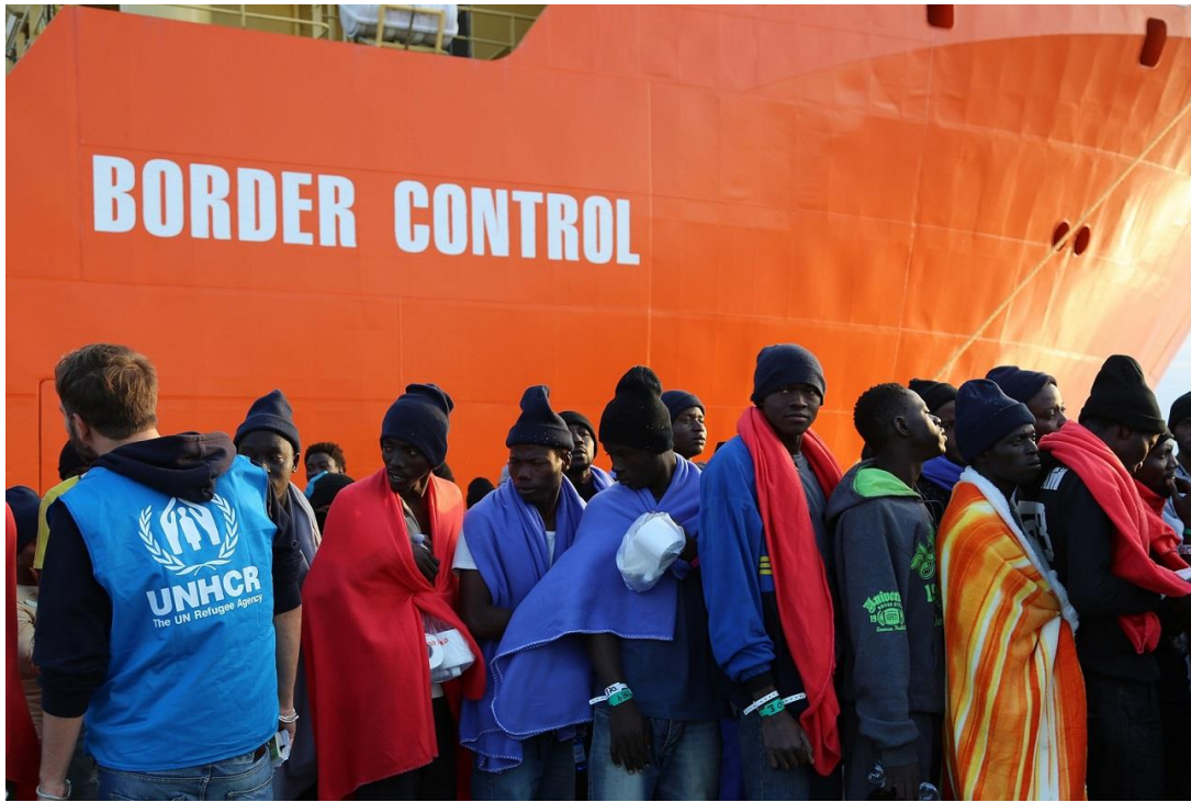
UNHCR staff provides information to refugees and migrants arriving by sea to Italy @F.Malavolta/UNHCR, November 2015.